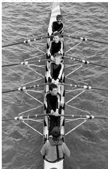
J154x+ at The Yorkshire Head

The squad concentrated early on in the season on producing a competitive coxed quad. They started well, winning at medal at Runcorn October Head against limited opposition. After that, they competed at Northwich and York Heads but were overshadowed by more imposing outfits. Nevertheless, the squad produced tidy crews and there was a constant dilemma as to who should be selected.