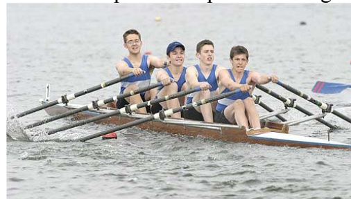
J16 4x at the National Schools Regatta

Gary Herbert, cox of the GB 2+ at the Barcelona Olympics, motivated the Searle brothers to win a gold medal in their final push for the line with the following words: "If not now, when?". The quote can be used to summarise the position J16 oarsmen find themselves in their careers as junior rowers. The J16 squad, backed up by a few tremendously enthusiastic parents, were fired up to take up the challenge.