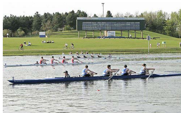
J16 4+ at Nottingham Regatta

2000m) to York City RC in the Men's Novice Four event.