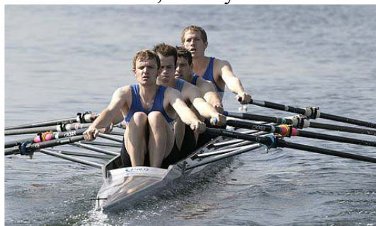
Mens Elite 4x at Nottingham Regatta