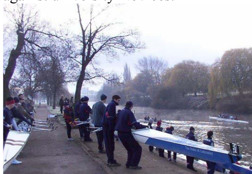
Below freezing at York Small Boats Head.