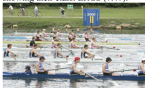
J16 4+ final at National Championships

A couple of weeks later the squad were back in Nottingham for the National Schools regatta. This was their biggest test so far. The 4+ came second (7.54) in their heat behind RGS Worcester and then fourth with their fastest time of the season (7.26) in the semis behind Latymer Upper, Stratford and St.Peter's. At Lancaster regatta they won the Men's Novice event against Tees RC and at the National Championships they earned their colours by reaching the final. The standard was high with Bedford Modern (7.07), Abingdon (7.13), Latymer Upper (7.16), Abingdon 'B' (7.20) and RGS Worcester (7.22) showing their class. LRGS (7.47).