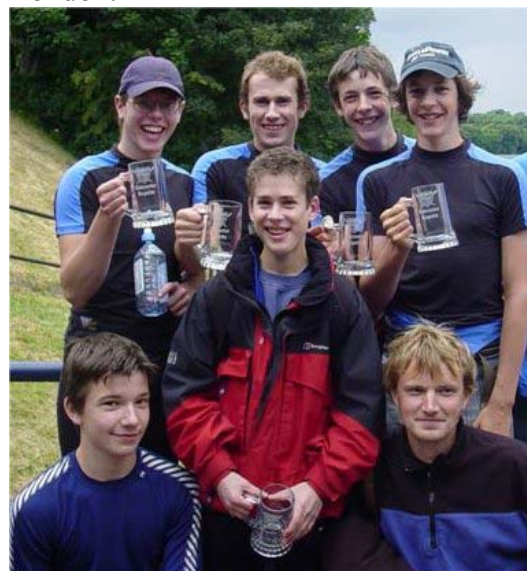
Pot winners at Lancaster Regatta

The boys set up a 24 Hr. Ergo Challenge before Christmas to help raise funds. Twenty boys (and one staff!) rowed for a combined time of 24 hrs. They completed a total of 337 km which is the equivalent straight line distance between Lancaster and London.