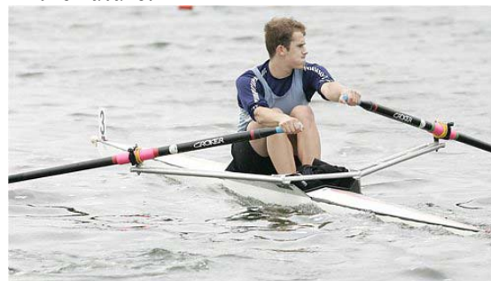
J18 1x at National Championships